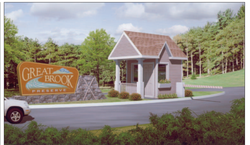
The guard shack at Great Brook Preserve at Sunday River will be welcoming as it is surrounded by acres of conversation land.

"First quarter sales are strong, making Great Brook Preserve the fastest selling de-